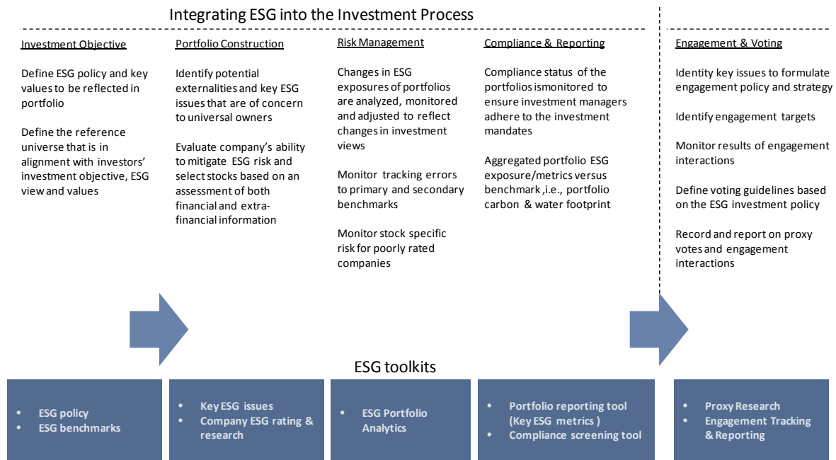
Exhibit 4: An Integrated ESG Investment Process

Exhibit 4 summarizes the key components of ESG integration and highlights some of the necessary tools to manage it.